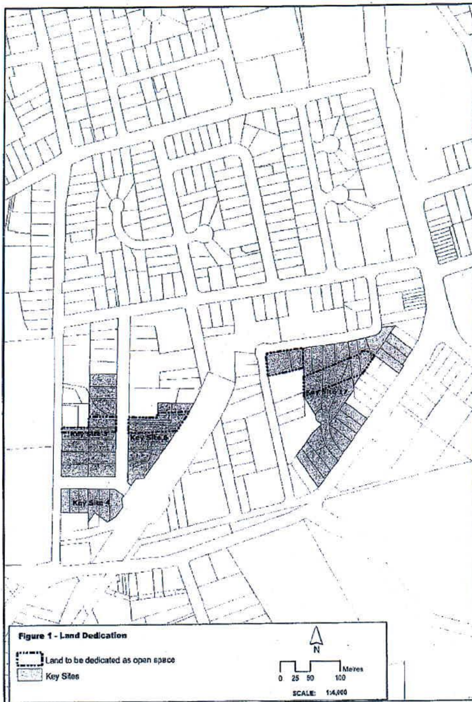
Figure 1 – Land Dedication